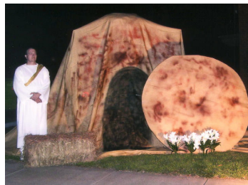
The Empty Tomb!

Mark your calendar and plan now to participate this year!