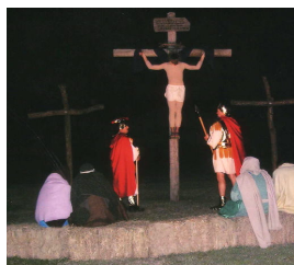
Jesus on the cross!

Mark your calendar and plan now to participate this year!